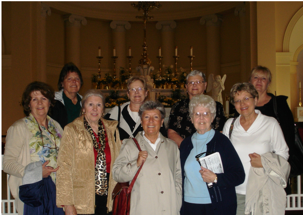
Picture taken on the Women's Guild's fieldtrip to the Cathedral in Baltimore.

Combine 1/2 C. butter or regular margarine, 1 C. brown sugar, firmly packed, and 1/4 C. milk. Bring to a boil and boil 3 minutes. Remove